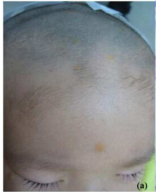
Figure 2a. An 18-month old male child presented with tan-orange macules 3-4 millimeter in diameter on head and forehead.

spontaneously after few months of follow-up.