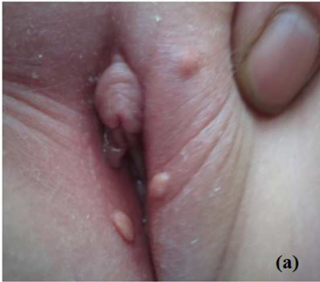
Figure 1a. An 18-month old female child developed papules with 2-3 millimeters in diameter in the vulva.

treatment was given, as the lesions resolved spontaneously after few months of follow-up.