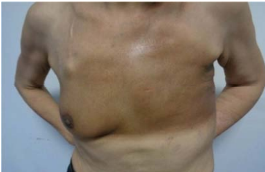
Figure 5. Three months later.