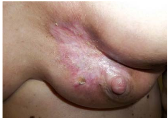
Figure 9. Three months later.