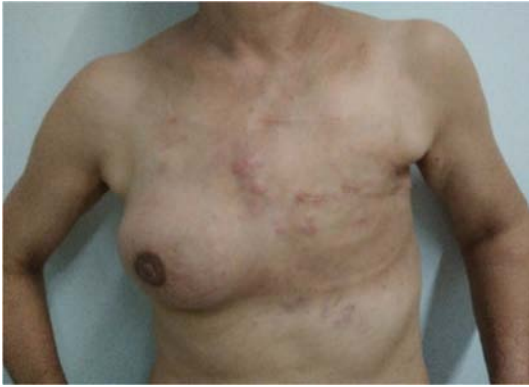
Figure 4. Before treatment.