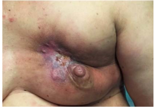
Figure 8. Before treatment.