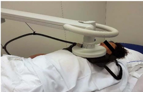
Figure 2. Treatment.

The authors describe the initial experience in Portugal, in the treatment of locoregional recurrence of malignant tumors, with the use of radiotherapy (reirradiation) in association with local hyperthermia, with a special focus on the initial tumoral response and associated acute toxicities.