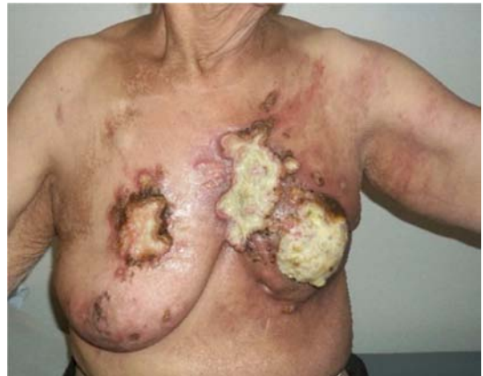
Figure 11. Three months later.