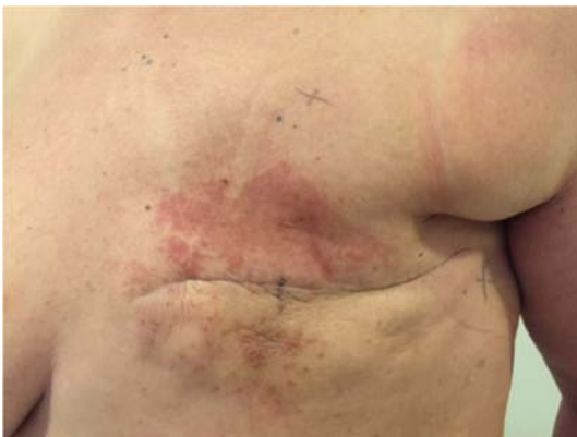
Figure 6. Before treatment.