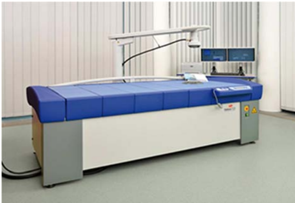
Figure 1. TCS 42 System.

The TCS 42 System is a non-invasive medical equipment of local HT that, through the use of its two active electrodes, emits a radiofrequency of 13.56 MHz. This allows to raise the tumoral temperature, focally and selectively (Figures 1 and 2).