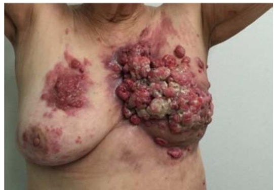
Figure 10. Before treatment.