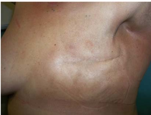
Figure 7. Three months later.